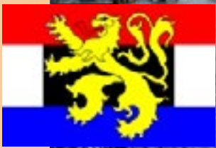
Unofficial flag of the Benelux